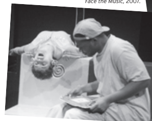
Face the Music, 2007.

Chicago Avenue Project classes will continue this fall in preparation for our next production in the spring. For more information call 612-825-0459.